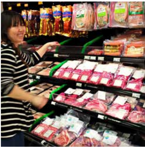
Plenty of Local Beef and Pork at Co-op Market

All of Alaska took notice when grocery shelves began emptying out this January.